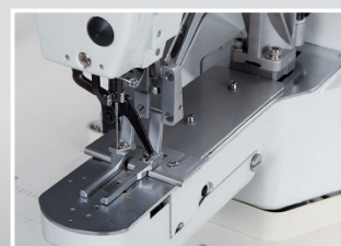
BT430Q-06 松紧带拼接 Elastic Band Joining