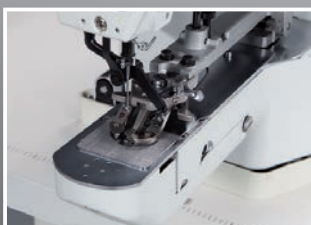
BT438Q 钮扣 Button sewing