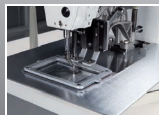
BT630Q 小型花样机(80x60) Small Area Pattern Sewing (80x60)

※BT530Q : 出厂时为套结机, 钮扣套件附在配件盒中, 用户可以操作面板切换车缝模式 ※BT530Q : Bartacking is the standard setting, while the button sewing kit is included. Customer can change the sewing mode by control panel.