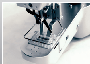
BT430Q-01 / 02 01标准Standard/02厚料Heavy material