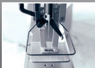
BT430Q-07 针织 Knits material