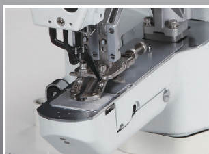
BT530Q 两用型 套结/钮扣 2-in-1 Bartacking/ Button sewing