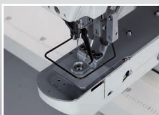
BT430Q-03 帽眼 Radial tacking