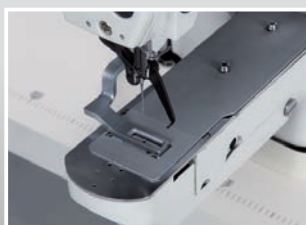
BT430Q-05 裤耳 Belt loop